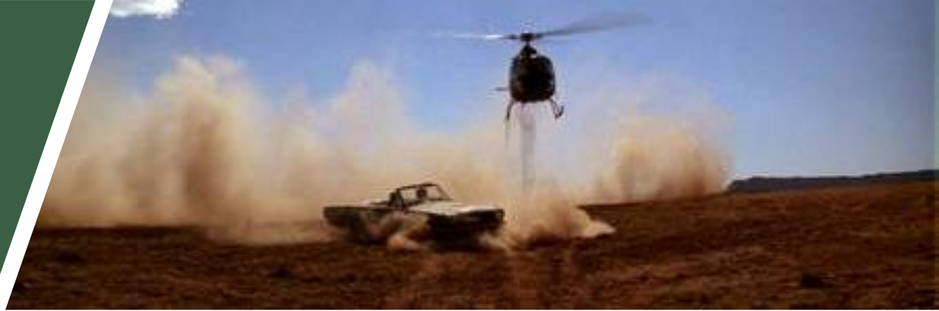
Illustration: “No Escape for Thelma and Louise”